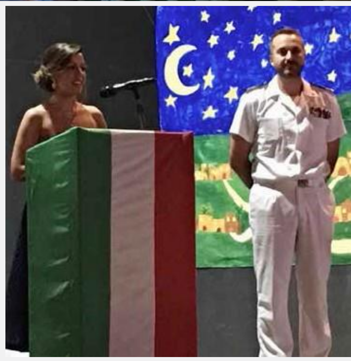
The Italian Frigate FREMM Carabiniere visited in Jeddah from December 27, 2016, to January 1, 2017.

For the occasion of the stop in Jeddah of the Italian Frigate FREMM Carabiniere, IBG, with the patronage of the Italian Consulate, organized a receptionatthe Italian Cultural Section on Saturday, December 31. French and American Business Groups were involved and collaborated toward the